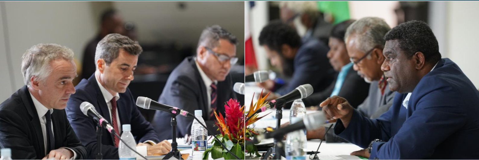
Special Envoy Director Benoît Guidée leads the French delegation and Deputy Prime Minister Johnny Koanapo leads the Vanuatu delegation

Talks are now underway between the governments of Vanuatu and France to resolve sovereignty over Umaenupne and Umaeneg/Leka islands and establish a permanent maritime boundary between Vanuatu and New Caledonia.